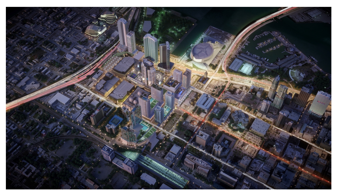
Miami Worldcenter Aerial Rendering. Rendering courtesy of Miami Worldcenter.

use tower with 310 branded residences atop a hotel and 50,000 square feet of medical office space. The second phase of Caoba is also expected to commence soon, which will encompass a 40-story tower with 420 multifamily apartments.