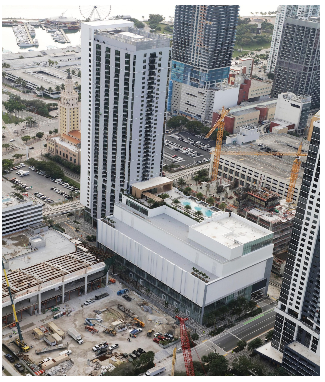
Block H- Completed.