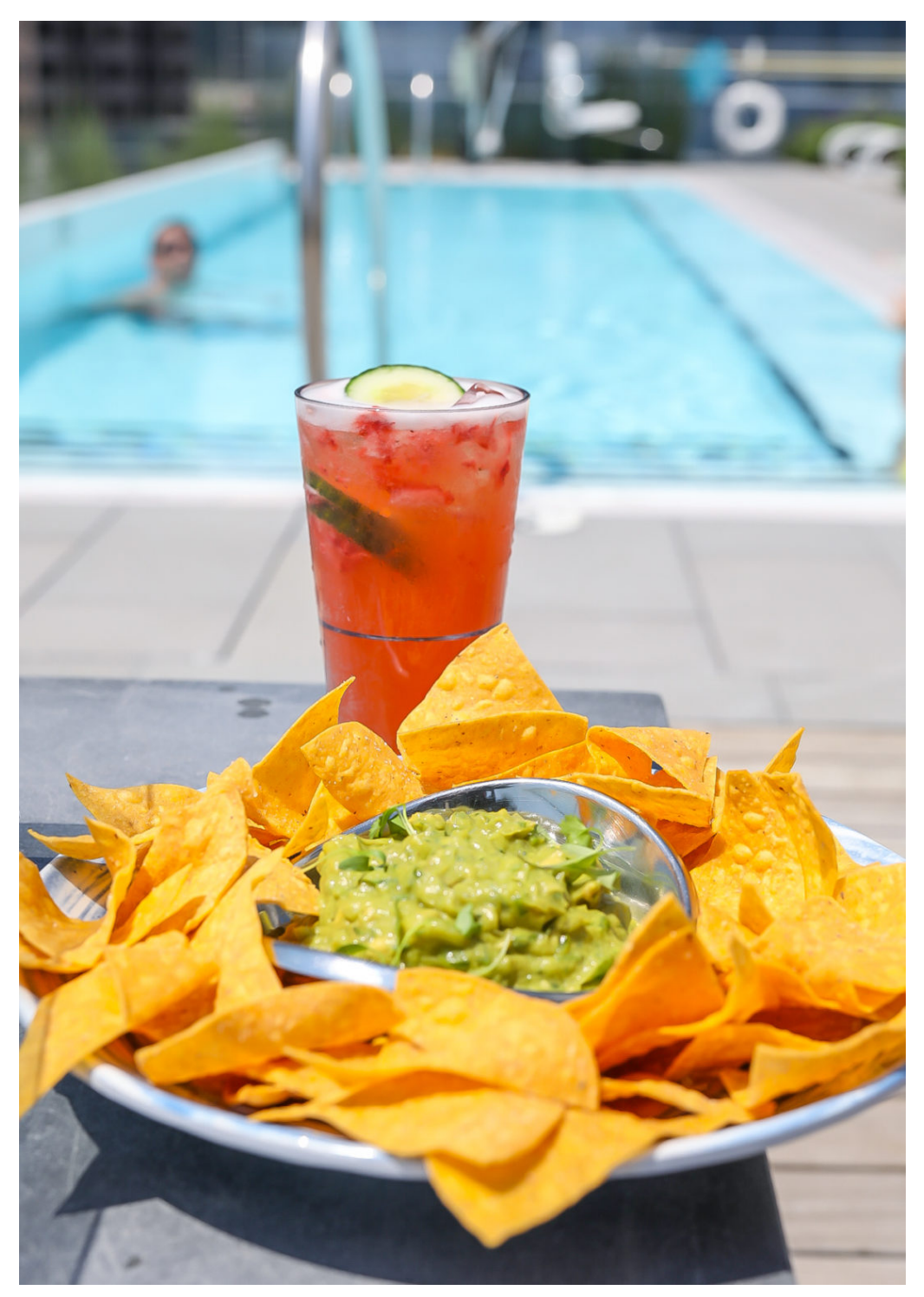
Whether you're searching for a serene staycation or a week-long great escape, the HALL Arts Hotel's new Sip, Savor & Splash Package is the perfect solution.