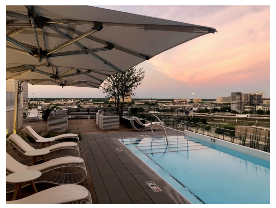
HALL Arts Hotel's rooftop pool, Waves, has some of the best views in the city.

This summer, the art-filled hotel is keeping North Texans on their toes with a summer lineup of activities that truly offers something for everyone.